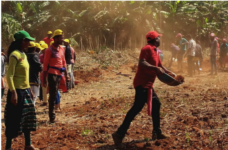
SPECIAL ANNUAL CAMP, RECHIKOPPA – 2018-19