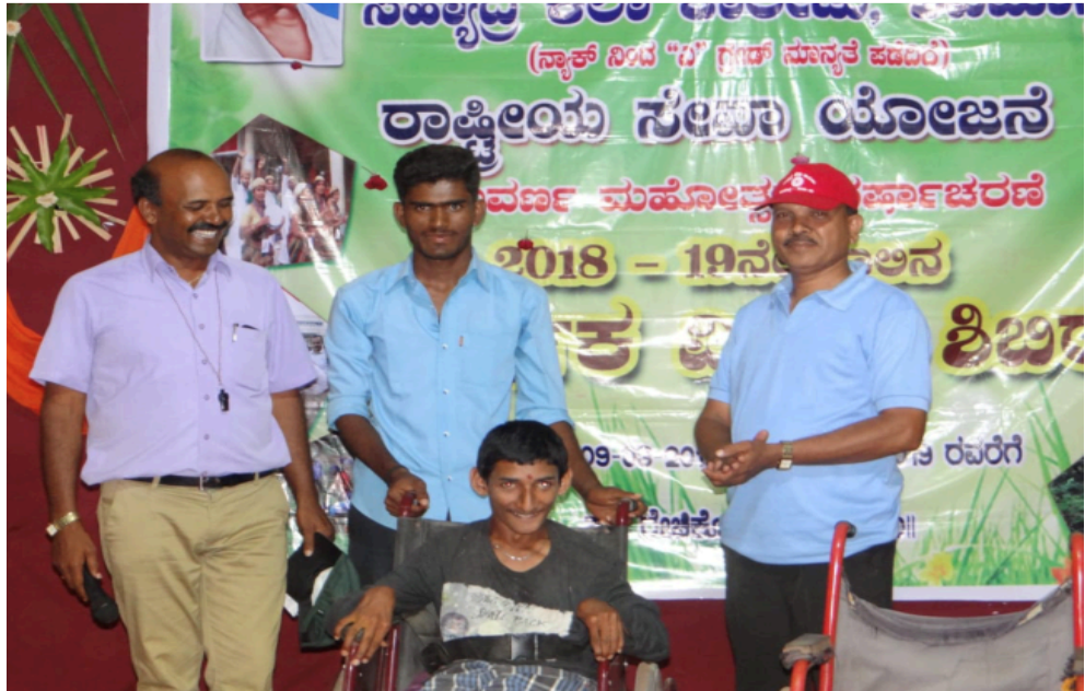
SPECIAL ANNUAL CAMP, KEREHALLI – 2019-20