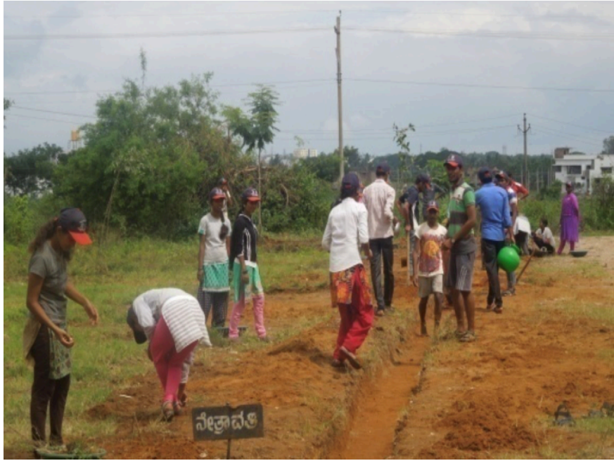
23 rd INTER COLLEGEAT CAMP - 2017